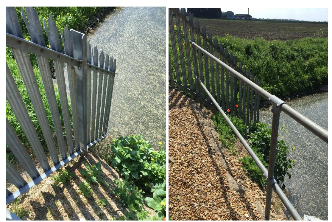
Figure 2 Typical environment where level sensor will need to be installed