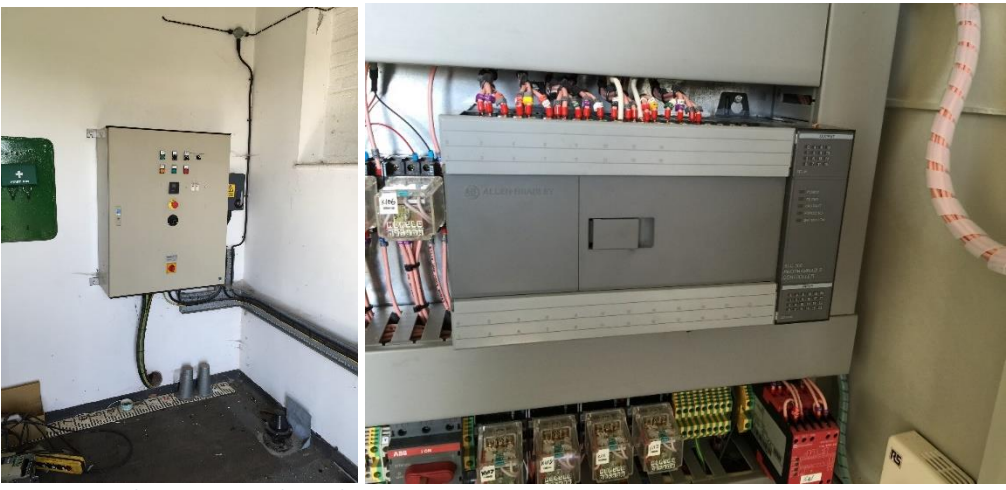
Figure 5Weed Screen Control Panel

The weed screen electrical panel has a PLC for local operation and control. The PLC has no serial port for connection to our Remote Terminal Unit.