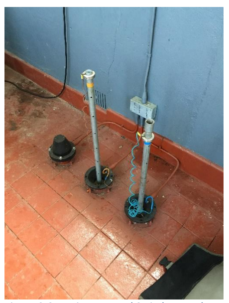
Figure 3 Capacitance Level Switches used to automatically start/stop pumps

Each site has a 3 phase electrical control panel for the pumps and where there is a weed screen, a separate 3 phase weed screen control panel.