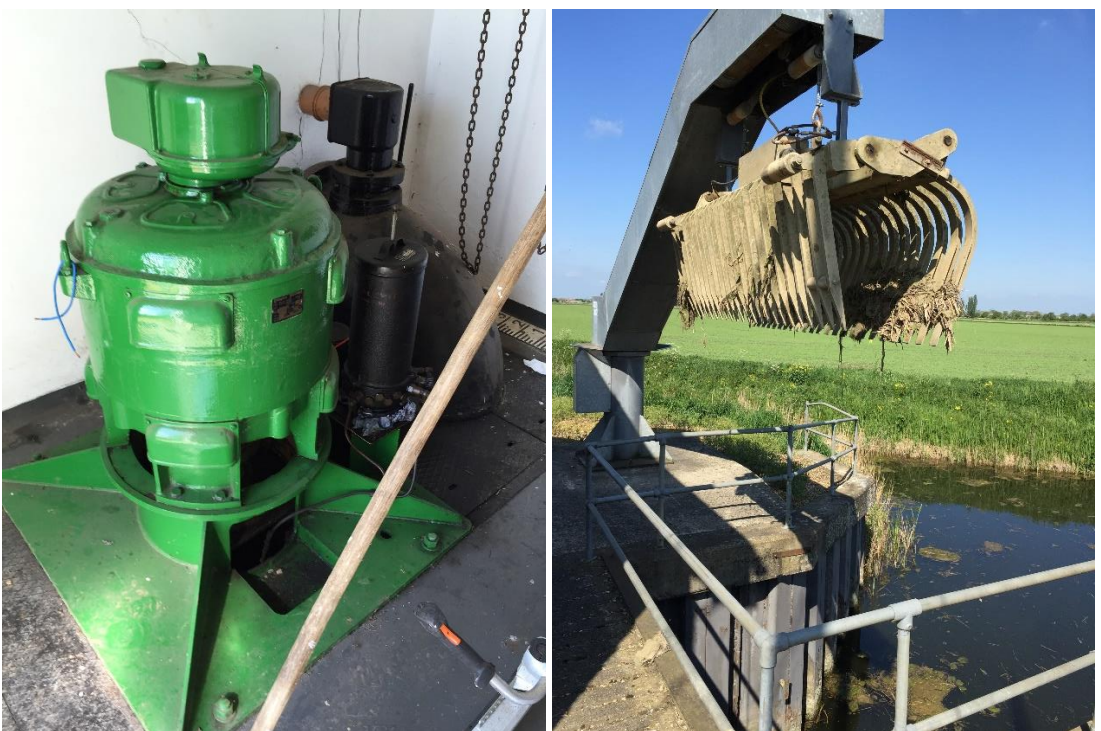
Figure 1Pump and Weed Screen

The pump station sites contain between 1 to 3 pumps and in most cases (but not all) an automated weed screen.