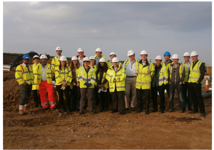
ICE/CIWEM Members site visit

On 3 September the site team hosted a visit by 20 members of the Chartered Institution of Water and Environmental Management (CIWEM) and the Institution of Civil Engineers (ICE). We gave a presentation about the project's background, design principles, challenges and construction stages at our contractor's Interserve Construction Ltd's site office. This was followed by a tour of the works area where our visitors had the opportunity to view the various stages of earthworks and ask questions. We received positive feedback from the visitors who enjoyed the event and learned many interesting facts about the locality, as well as technical matters.