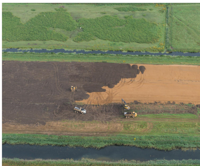
Top soiling Rings End to Poplar House Farm

All of the material has now been delivered and you will have noticed a significant reduction in lorry movements to this work area. 97% of all the material has now been placed with 80% trimmed and ready for top-soiling - of which 50% is complete. We are using the original topsoil that we stripped at the start of the works. From this, the bank is naturally self-seeding itself and we will be enhancing the grass coverage with a conventional grass seeding method, using a tractor and seed box.