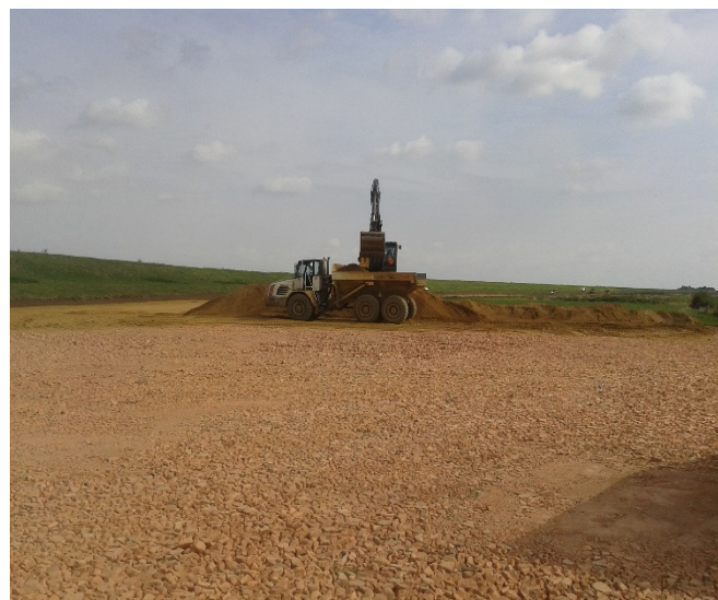
Material deliveries at St Peter's Farm

Work is progressing at two locations: between Bassenhally and St Peter's Farm and between St Peter's Farm and Poplar House Farm. This involves stripping topsoil, material deliveries and placement.